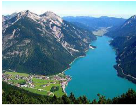
Our first hike will be from the lake Achensee up to exactly this point of view