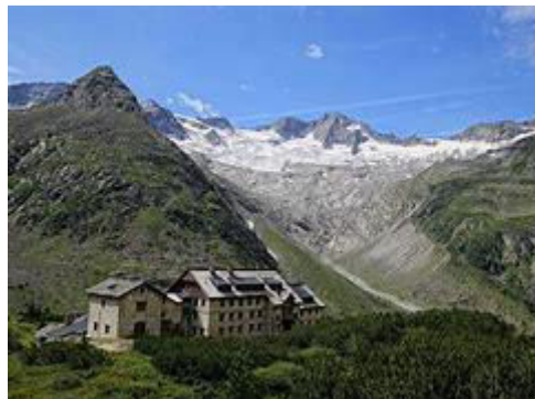
Die Berliner Hütte – one of the huts we will stay in overnight during the hike