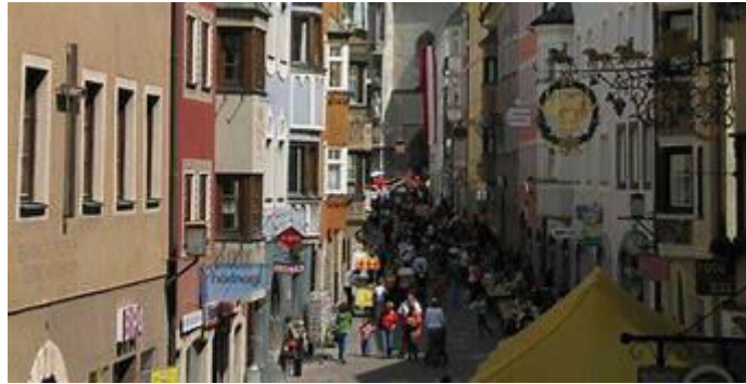
City of Schwaz, where you will be hosted