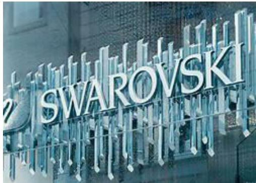
Visit of the Swarovski factory