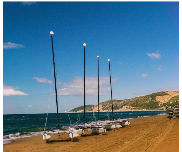
Sailing skate - Náutico Club Castelldefels

After lunch, transfer to the city center and free afternoon.