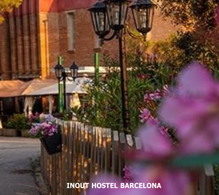
INOUT HOSTEL BARCELONA