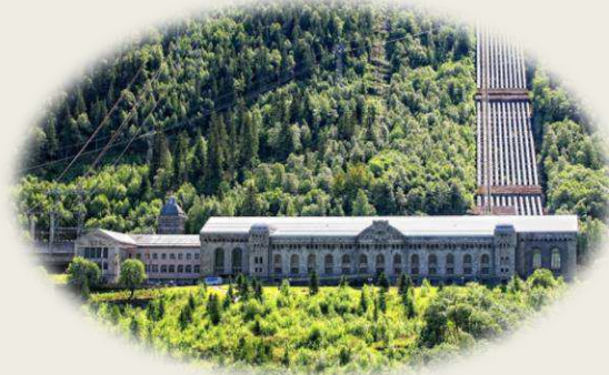
2. Bø (9-13 August)