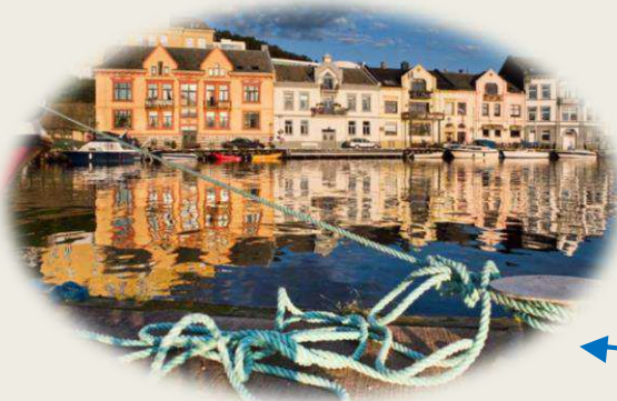
3. Farsund (13-17 August)