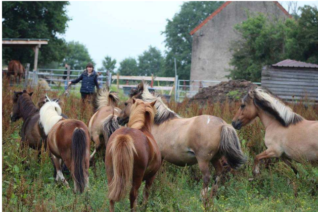
HORSES LIVE ALL YEAR ROUND

You will experience international friendship, practice horseback riding in the middle of the nature. We offer many equestrian activities.