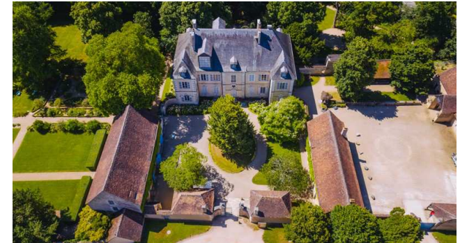
Georges SAND Domaine in NOHANT