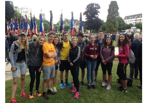
STUDENTS AND BASTILLE DAY IN CAMP 2016